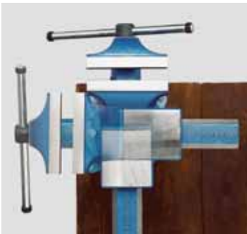
Infinitely adjustable swivel base allows vise to lock securely in any position