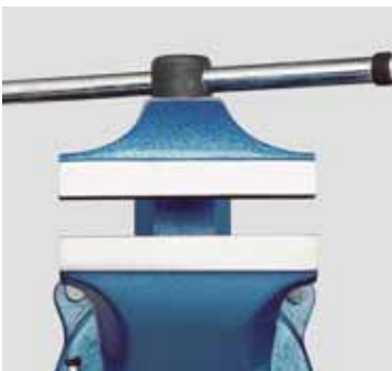
Generously sized jaws provide greater clamping surface